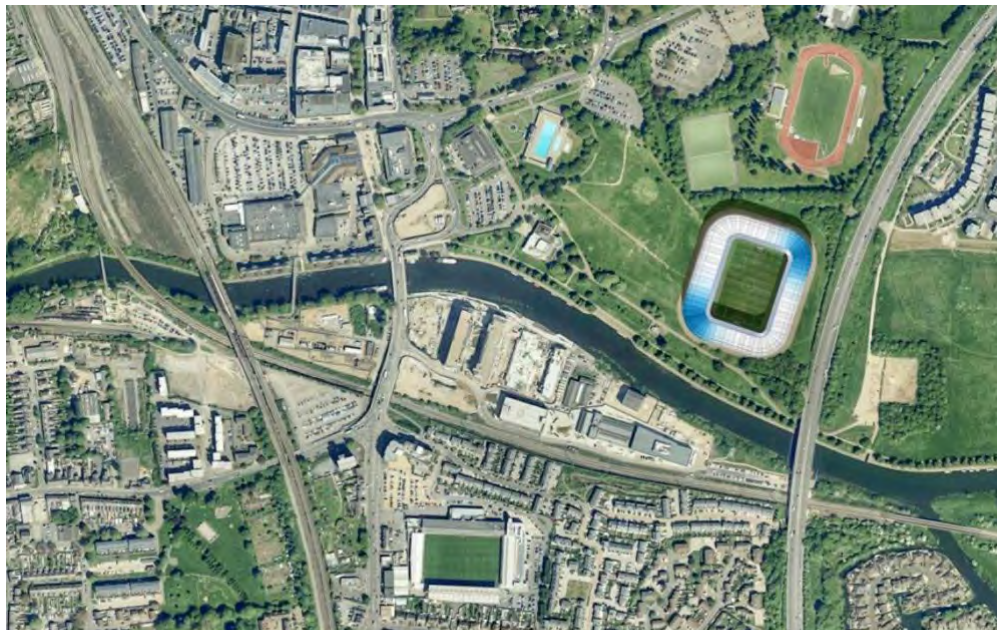
Photograph, with stadium image added, from 'Peterborough Matters' website

Whilst keen to welcome the start of the long-awaited University project, back in April we publicised our concern that no overall Master Plan had been drafted for the Embankment as a whole. We were therefore pleased to see that the City Council included the request for funding for such a plan in the Town Fund bid to government. That has turned to concern that part-funding for such a plan is being provided by the owners of PUFC who have a major interest in