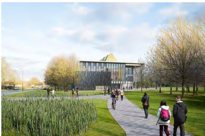
Original design showing roof-top lanterns, now removed

We were pleased to see Phase 1 of the new Anglia Ruskin University development off Bishops Road receive its planning approval on 12 th November. A fine three-storey building, it will make a positive contribution to the urban landscape without dominating its sensitive locality within sight of the Cathedral (see computer-generated image). The 5m high lanterns proposed for its roof concerned the Conservation Officer (and some of us) over their effect on views of the Cathedral. These have been replaced with a single rooftop structure running the length of the building at a much-reduced height. A construction start will be imminent.